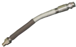
AGW-0270 Fan Spray Wand