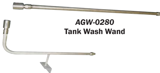
AGW-0250 Wine Barrel Wash Wand