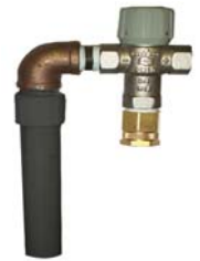
MPI-0380 Hot Water Protection Device (Installs at water inlet)

For more information please visit us at www.delozone.com